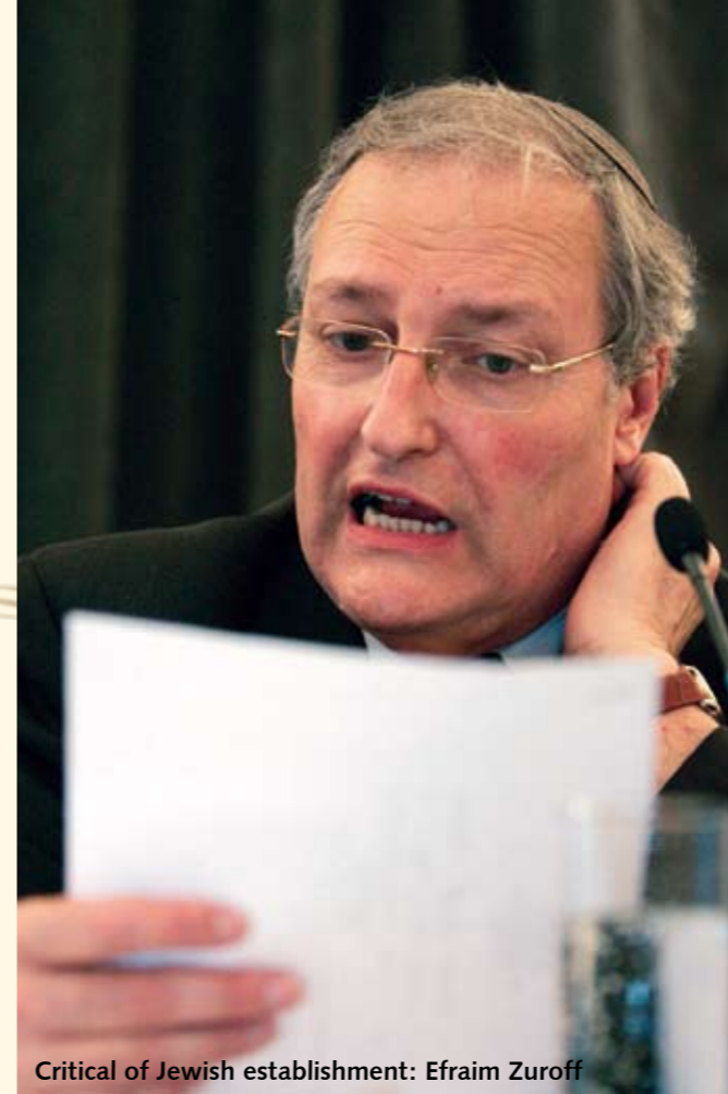
Critical of Jewish establishment: Efraim Zuroff