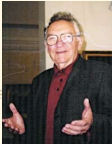
Proud to have fought back: Yitzhak Arad