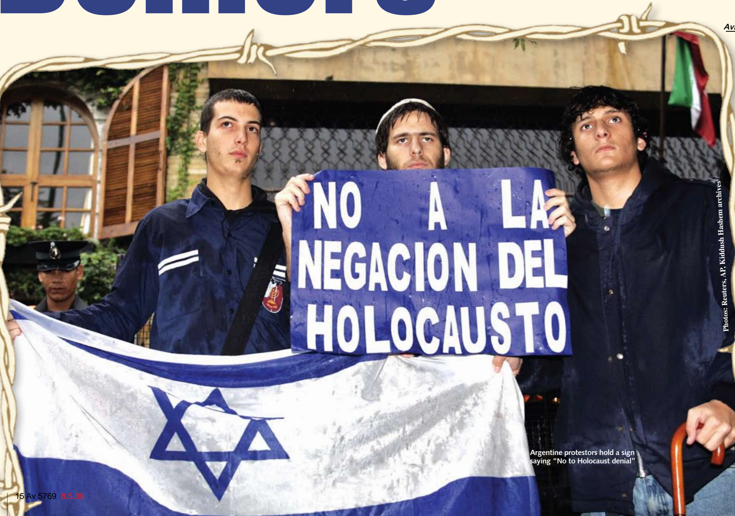
Argentine protestors hold a sign saying "No to Holocaust denial"