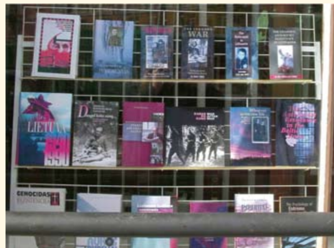
Now being prosecuted: Soviet Partisans, c.1941

groups [qualifying as victims of] the crime of genocide — they are national, ethnic, racial, and religious groups. However, the definition of the very term genocide by its author, Raphael Lemkin, also involved attacks against political and social groups... It was only at the last moment that with efforts of the Soviet Union and its satellites — other puppet communist regimes — no place was left in the final text of the convention for repression against political groups.”