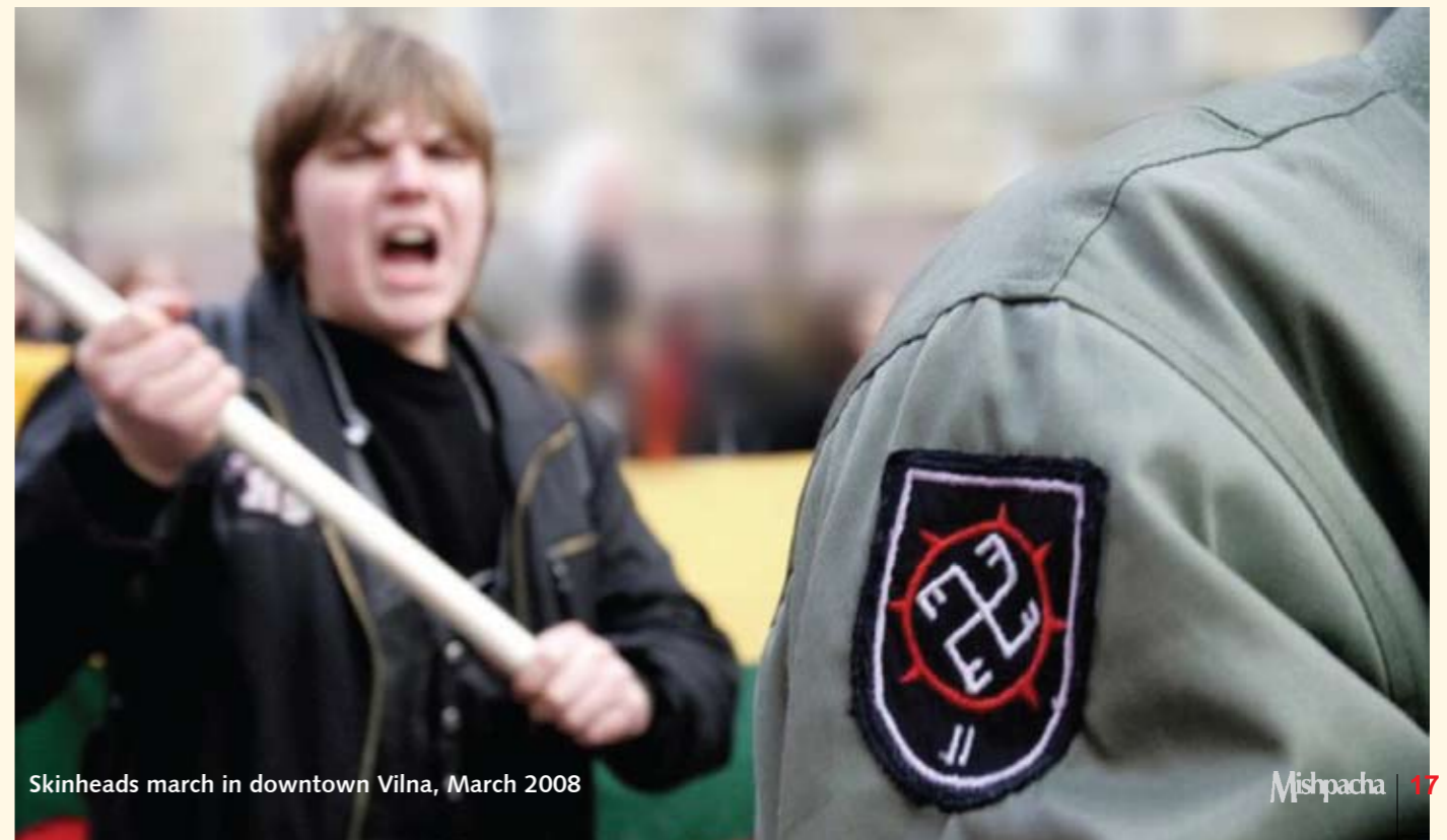
Skinheads march in downtown Vilna, March 2008

"The latest campaign to prosecute Soviet anti-Nazi Jewish partisans is merely another link in this chain of historical duplicity and distortion. The truth about the Shoah must finally be told in