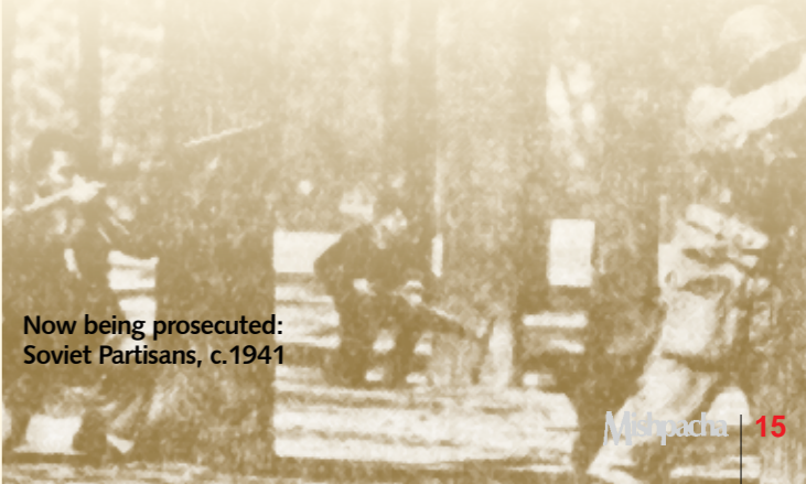
Now being prosecuted: Soviet Partisans, c.1941

Prosecuting Heroes Another manifestation of the Baltic attempt to rewrite history in recent years has been a wave of accusations and investigations against Jewish heroes who escaped death by fighting alongside Soviet partisans against the Nazis. Particularly in Lithuania, prosecutors are combing the memoirs of several elderly Jews for evidence that they murdered Lithuanian citizens.